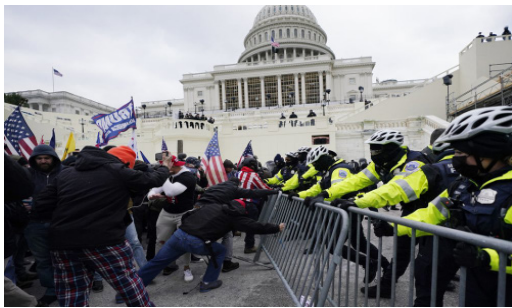
Capitol Hill rioters

"If the roles were reversed, if those were African-Americans, Black people, it would be totally different," NBA all-star Russel Westbrook said, "It's very disheartening in a lot of ways a lackof sense of urgency to respond to what was going on versus