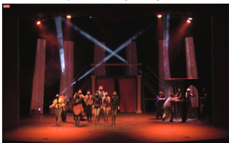
Performers show off their skills for viewers of a live stream

Performances will still be safe and secure for those watching and those performing. The rules and protocols theatre has set in place have made the experience a lot safer for those performing and spectating.